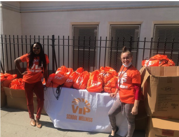
VIP's School Wellness Team distributing backpacks outside CS44 and KIPP Freedom Schools

On Sept. 19, 2022, VIP launched its first school-based mental health clinic. The kick-off event was held along with the unveiling of our mural: Celebrating Community in a Healthy Way , in partnership with CS44 and KIPP Freedom Middle School. Both schools are adjacent to our headquarters on 770 East 176 th Street, in the Bronx.