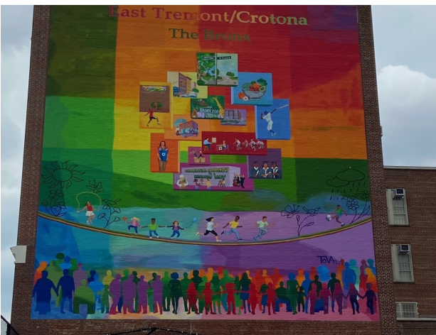
VIP's latest mural Celebrating Community in a Healthy Way

Since Jan. 1, 2022, our Wellness Center has seen 22 children for a total of 273 visits. Within a month of launching our school-based clinic, we engaged 13 students and successfully enrolled 10 into the program.